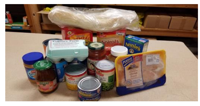
You can donate any of these items at any time. Contact us and we'll even arrange to pick it up!

Too busy to do extra shopping? Donate instead and we'll buy it. Just go to <a href="https://www.starfishplainfield.org">www.starfishplainfield.org</a> and click on the "Donate" button.